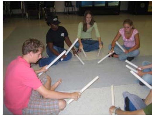
Left: Delegates play a game of Chinese Sticks at Summer Camp.

with their leaders and a staff of four, lived together, played together,