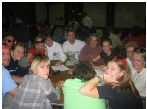
Jacksonville CISV members work on the new Mosaic project