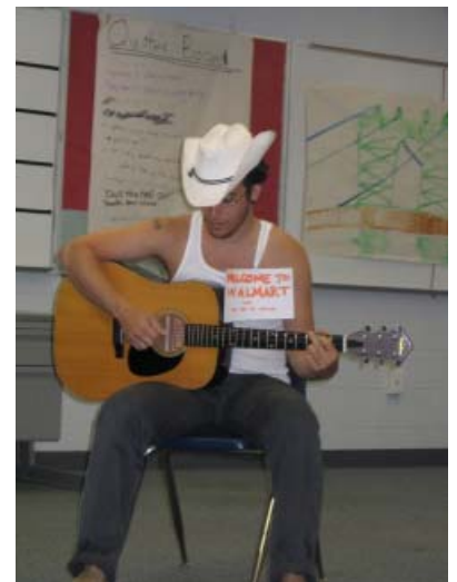
His sign reads "Welcome to Walmart - I'm the new PA system"