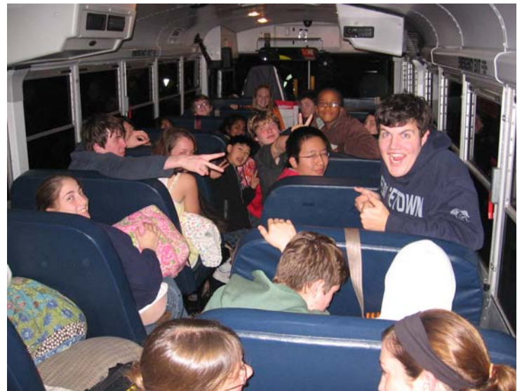
CISVers have fun no matter what they do!