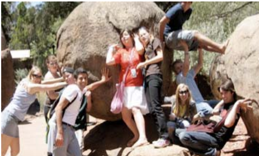
Seminar Campers at the Perth Zoo

The countries in my camp included: Australia, Brazil, Sweden, Philippines, New Zealand, Costa Rica, Canada, Austria, Norway, United Kingdom, Germany, Finland, and USA. We noticed differences in the laws and media of our home nations, but otherwise felt like we could have come from the same country.