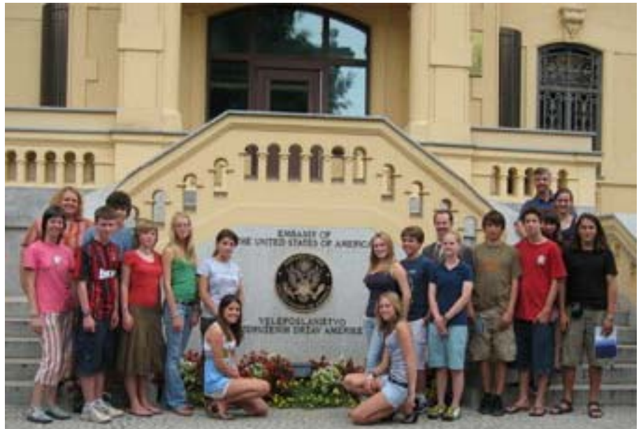
Slovenia IC at the American Embassy