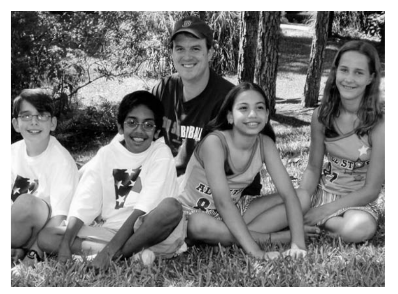
Faroe Island Delegation

June 2-16 the first annual "Faces of Jacksonville" (FOJV) village was held in conjunction with NCCJ (The National Conference for Community and Justice). This local work project is a 2-week village for children from different cultural and ethnic groups within Jacksonville.