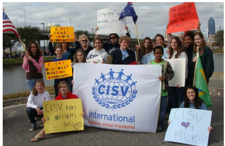
Martin Luther King Parade 2010