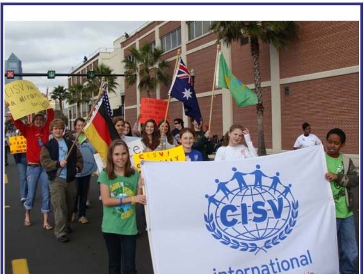
CISV Junior Branch members show their support for Martin Luther King's vision of peace.