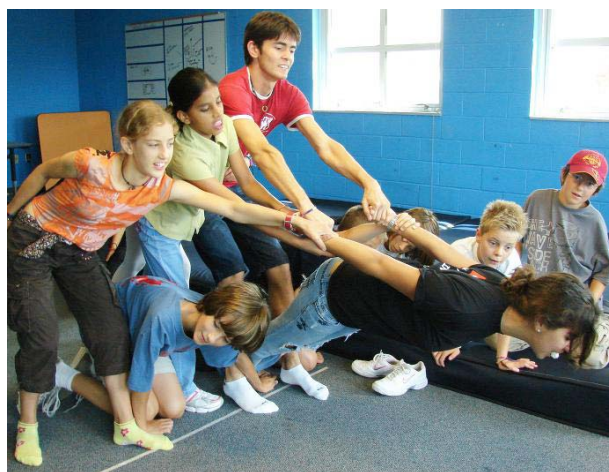
Team Building is an important skill for all Villagers to learn.

recipients of CISV Jacksonville’s hospitality this summer at the “Fish Have No Feet” Village. Children and leaders were