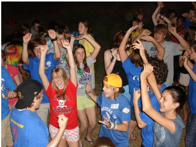
Minicamp had one CRAZY dance party.