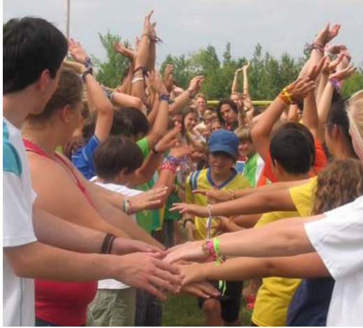
If you trust us you can run FAST through the hands

because I couldn't see any thing about results of my actions. I would t h i s spend six months organizing organization