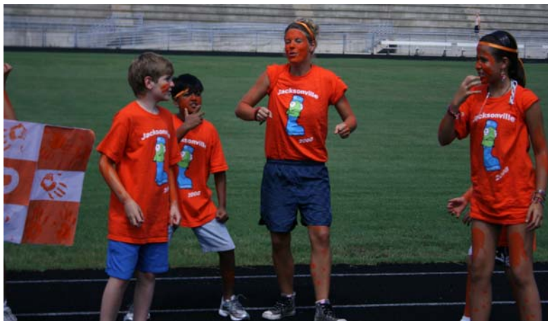
“Fish Have No Feet” participants show Team Spirit.

Children from 17 countries were the all affected by the village program content to a greater their countries feeling that Americans were friendly, you helped by volunteering in some way as well. Thank