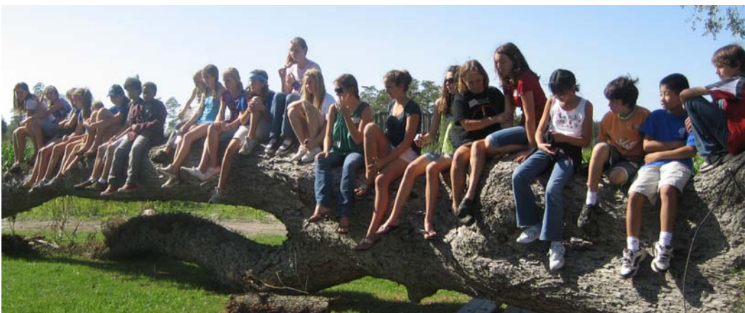
Above: JB board enjoys the Conner’s Cornfield Maize.