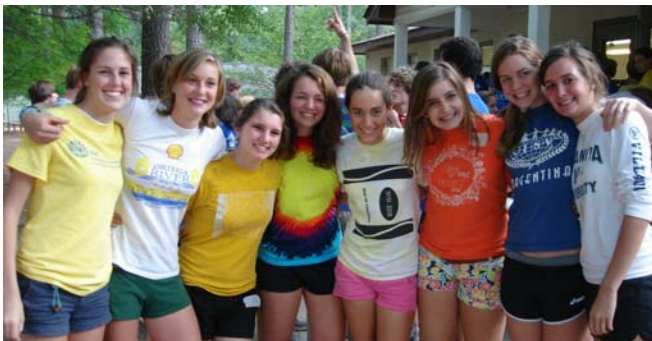
Some of the JB girls enjoying minicamp.