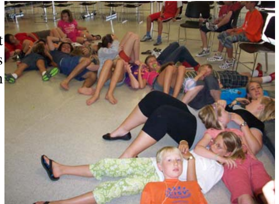
Belly Laughing Circle

to overcome differences, and how easy it is to work together. It is easy for me to think that peace is possible knowing that there are people like me all over the world... in CISV. I still wear nine multicolored bracelets hand-made by the children to remind me daily.”