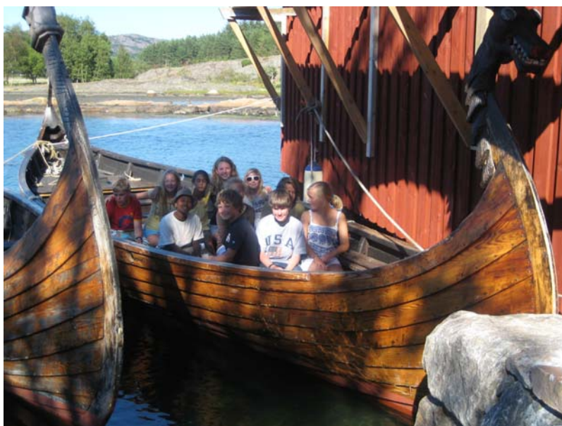
Top Photo: Norwegian theme park