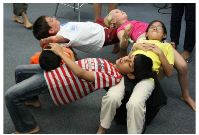
Trust activity at the "Fish Have No Feet" Village

and with a much better understanding of how lucky we are to be children in the U.S.