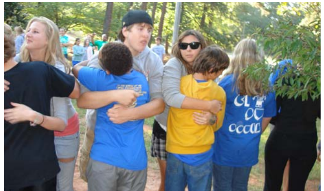
We were all so sad to leave minicamp!