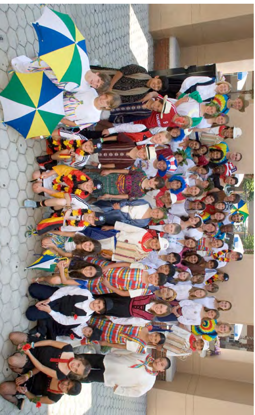
Participating Countries: Argentina, Brazil, Canada, Costa Rica, Germany, Guatemala, India, Indonesia, Italy, Norway, Philippines, and USA

E-mail: pdpritchard@bellsouth.net Office: 880-2139 Home: 260-5270