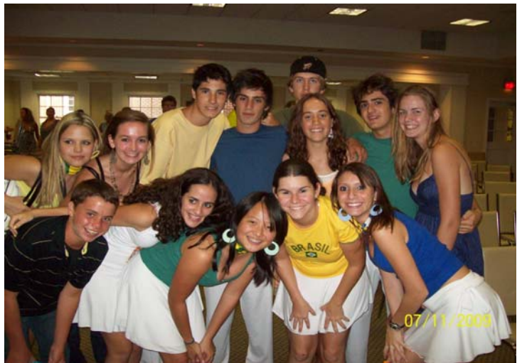
Brazil Delegation National Night